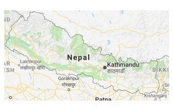
48 participants from Nepal